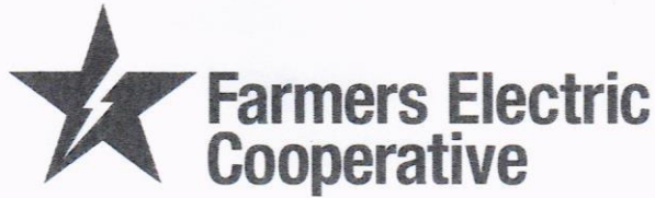
EXHIBIT tabbles® 2